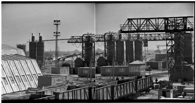
1 Construction of the Chernobyl Nuclear Power Plant, 1971

Total indifference in the 90s, limited interest in the following decade or attempts to commercialize the past and a rediscovery fueled by "archival impulse" in 2010s, followed by decolonial struggle synthesizes the ongoing transformations of collective memory in Ukraine.