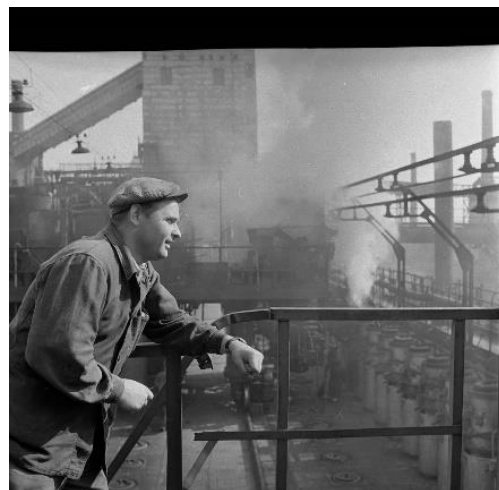
2 A Worker, 1964